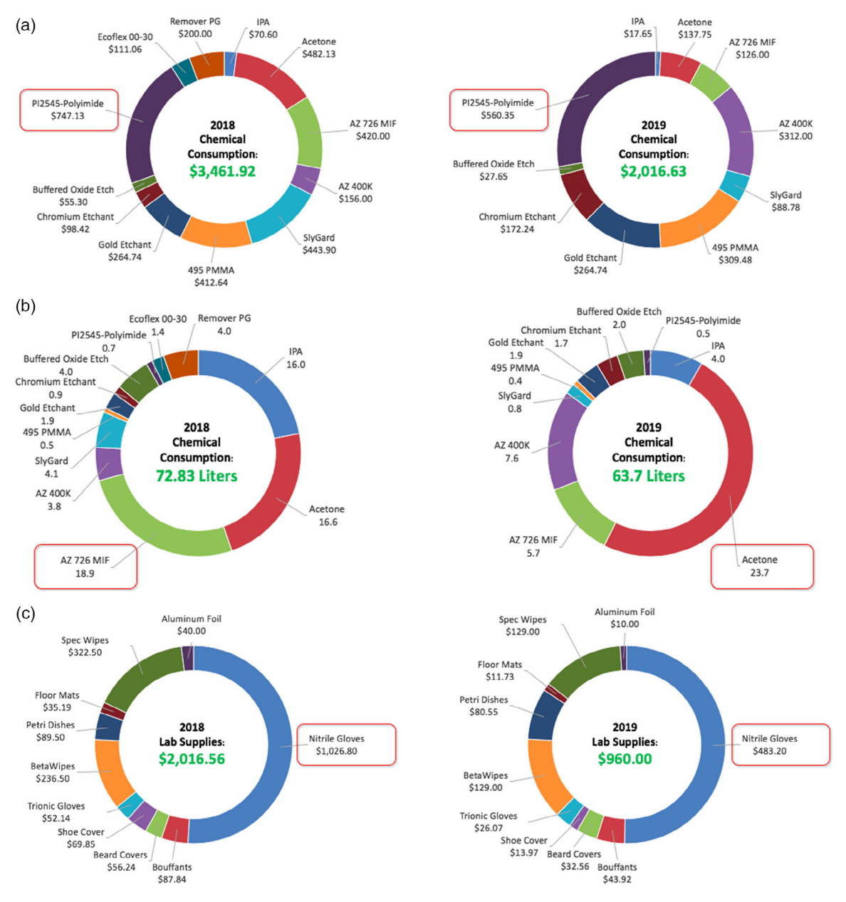
Figure 2. Comparison of 2018 and 2019 in terms of the cost of consumed chemicals, amount of consumed chemicals, and cost of consumed materials. a) Comparison of the cost of chemicals consumed in the cleanroom between 2018 and 2019. Chemicals include: isopropanol (IPA), acetone, AZ 726 metal-ion-free (MIF), AZ 400K, SlyGard, 495 polymethyl methacrylate acrylic (PMMA), gold etchant, chromium etchant, buffered oxide etchant, PI-2545 nonphotodefinable, wet etch, Ecoflex 00-30, and remover PG. This shows that there was a reduction in overall spending on chemicals between 2018 and 2019. b) Comparison of the amount of chemicals consumed measured in liters in the cleanroom between 2018 and 2019. Chemicals include: IPA, acetone, AZ 726 MIF, AZ 400K, SlyGard, PMMA, gold etchant, chromium etchant, buffered oxide etchant, PI-2545 nonphotodefinable, wet etch, Ecoflex 00-30, and remover PG. This shows that there was a reduction in overall spending on chemicals include: IPA, acetone, AZ 726 MIF, AZ 400K, SlyGard, PMMA, gold etchant, chromium etchant, buffered oxide etchant, PI-2545 nonphotodefinable, wet etch, Ecoflex 00-30, and remover PG. This shows that there was a reduction in overall chemical consumption between 2018 and 2019. c) Comparison of the cost of materials consumed in the cleanroom between 2018 and 2019. Materials include: nitrile gloves, bouffants, beard covers, shoe covers, trionic gloves, BetaWipes, Petri dishes, floor mats, spec wipes, and aluminum foil. This shows that there was a reduction in overall spending on lab supplies between 2018 and 2019.

cleanroom, and saw a decrease in total expenditure on those items, from $2,016.56 in 2018 to, $960.00 in 2019 (Figure 2c).